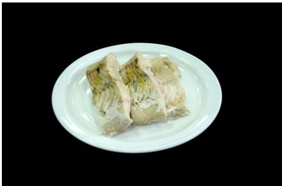
Pike perch steam