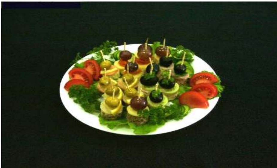
Canape in assortment (Cheese, fish escolar, fish salmon, roast beef, ham)