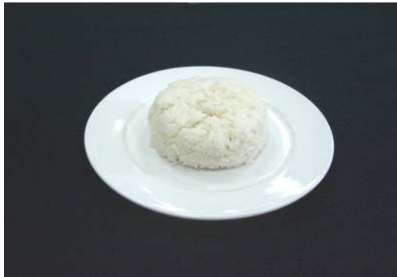
Pace of rice