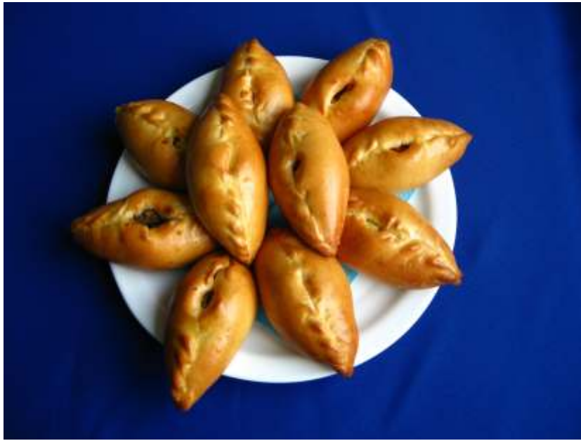
Patties in assortment