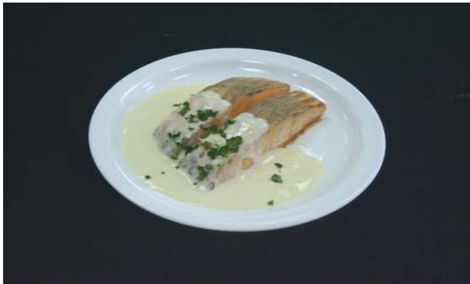
Salmon baked with sauce