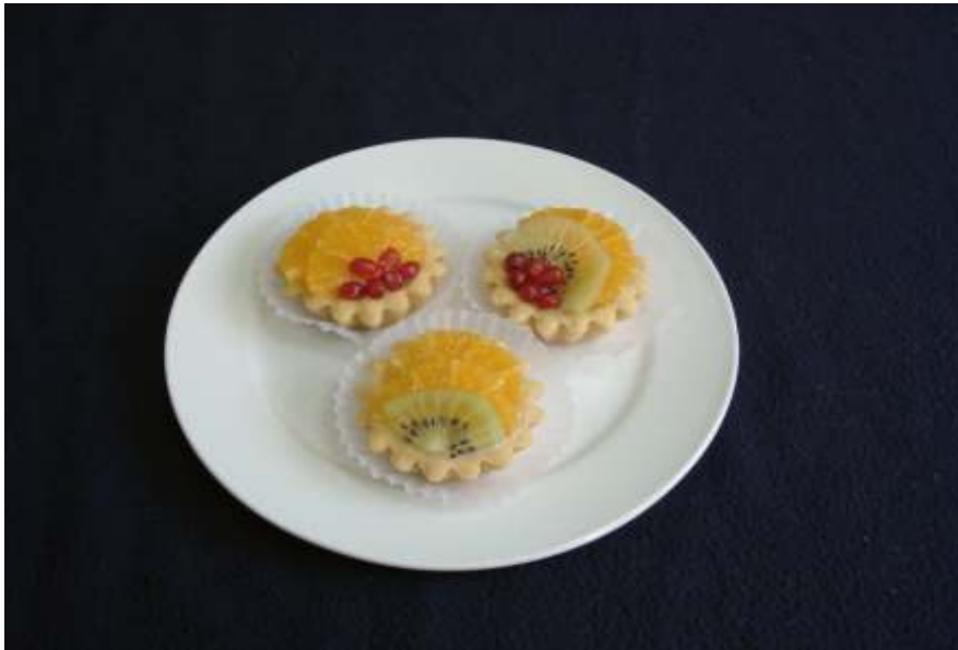
Cake “the Tartalet fruit”