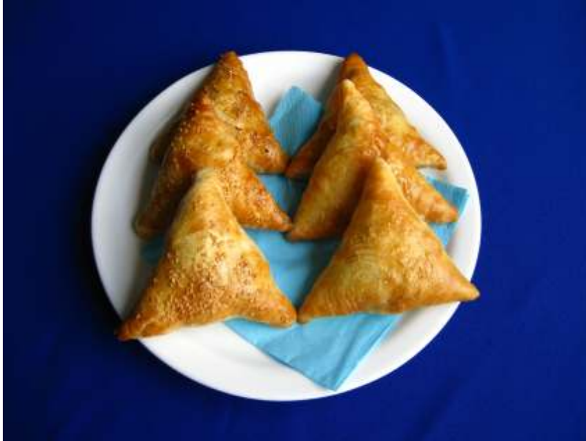
Samsy flacky paste