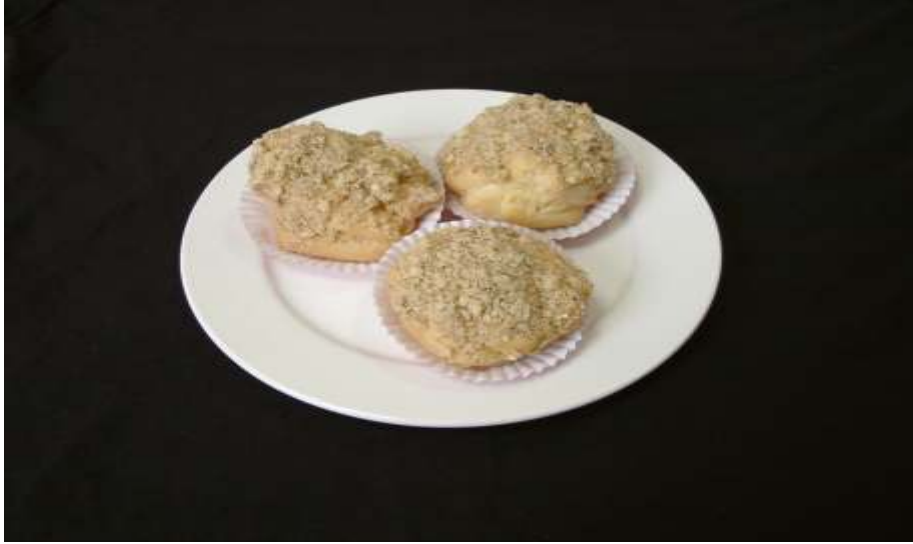
Cake “the Eclair in nuts”