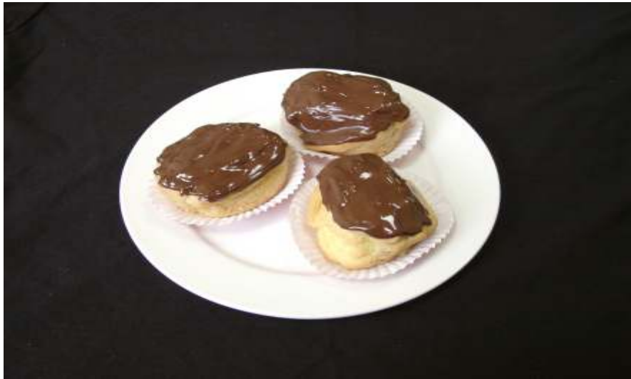
Cake “the Eclair in chocolate”